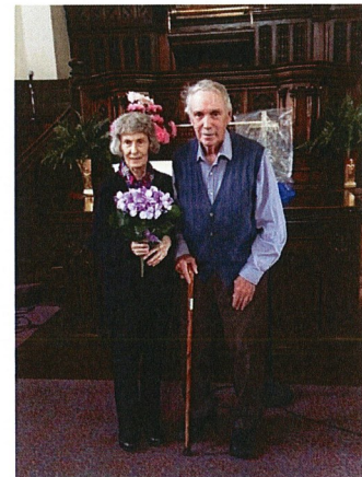
June 15, 2022