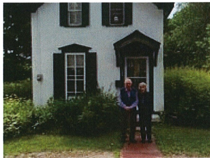
Stratton House 2022