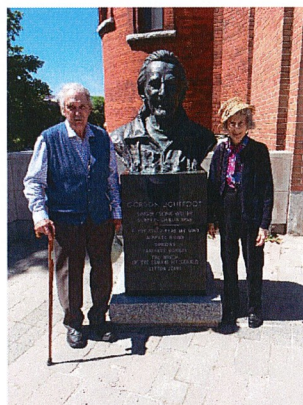
Gordon Lightfoot Bust City Hall