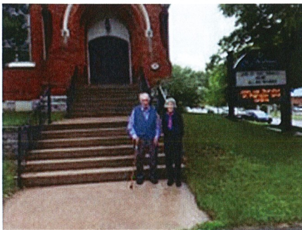
St Andrews Presbyterian Church