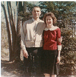
Stratton House Grounds 1967