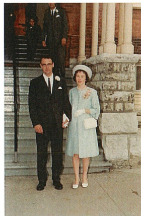
June 15, 1968,