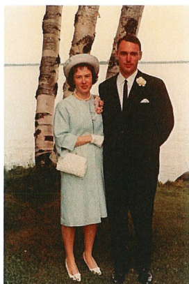
Birchmere Lodge Grounds