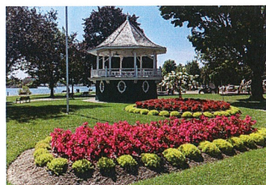
Couching Beach Park

In the twilight of our years, memories, held dear to our hearts, begin to fade. A memorable trip, one which we may not make again.