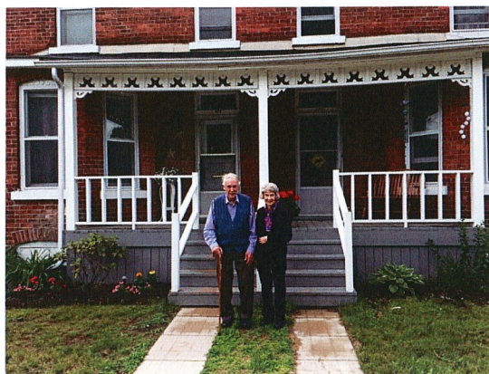
Mary Street House